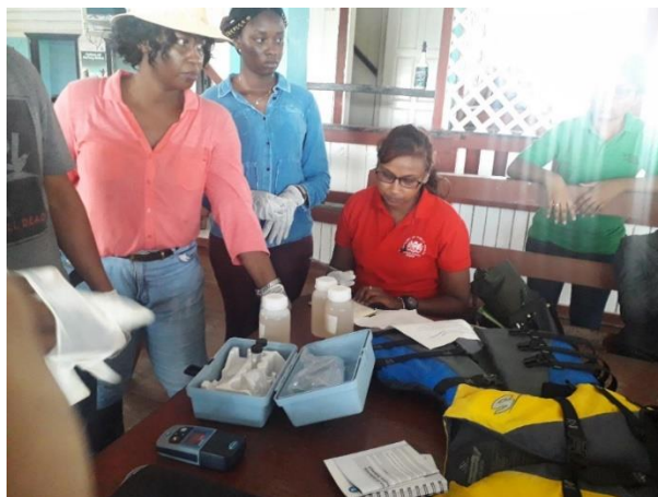
Participants preparing to use a colorimeter to measure the concentration of phosphate in the water sample