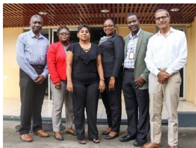
The CityLab Project Partners: U.G; GTI; UWI and Anton de Kom University