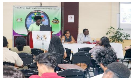
Representative – Eco Trust Society