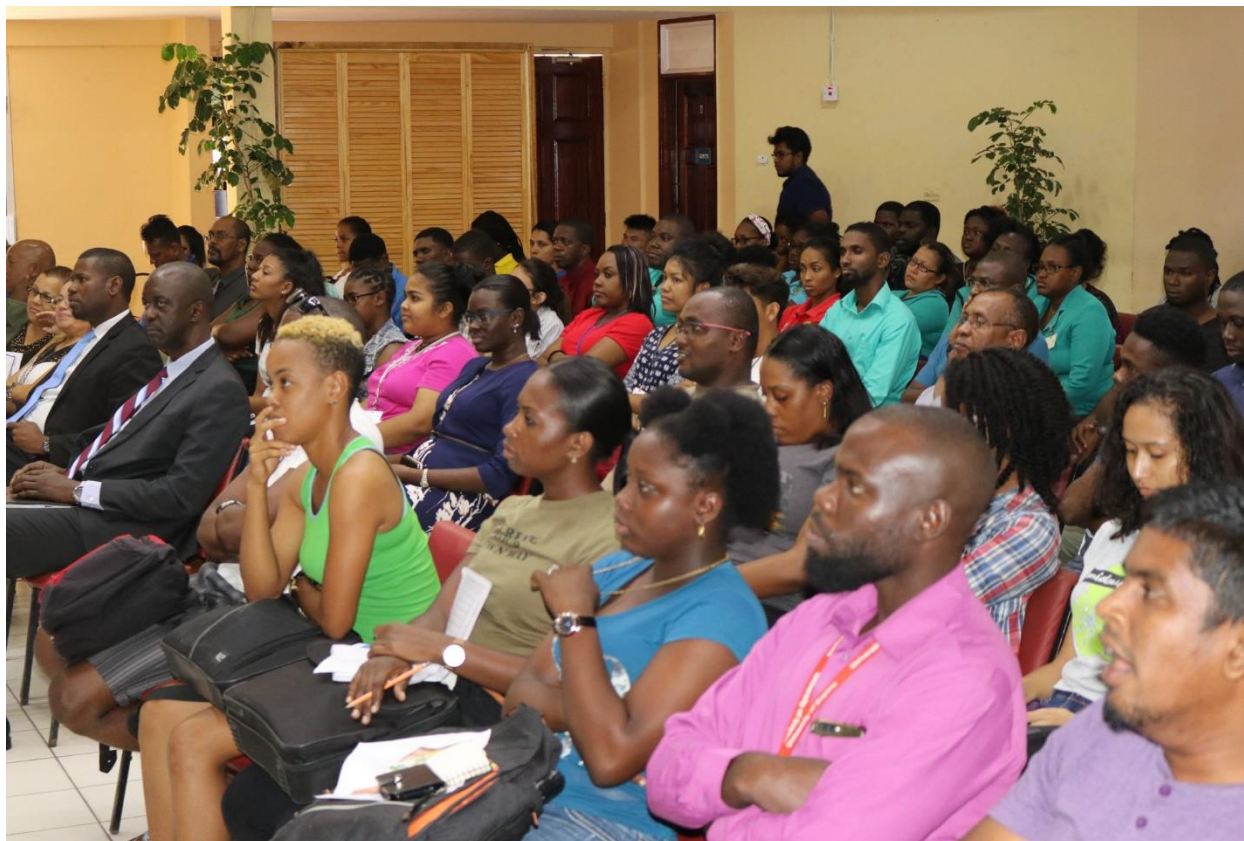
Cross-section of participants at the lecture.