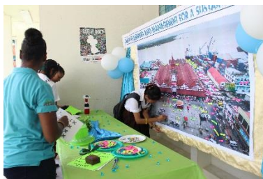
Students interacting with the participants