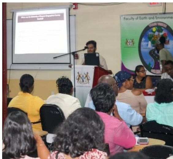
Representative – UG Geographical Society (UGGS)