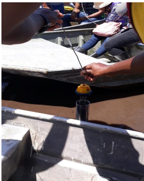
Participant using a depth sampler