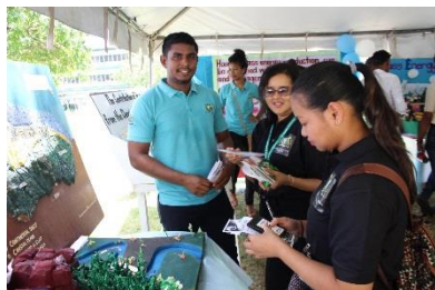
Students interacting with the participants