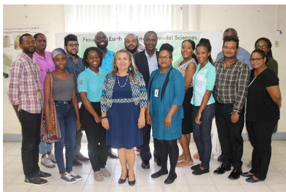
Some of the UG participants at the conference