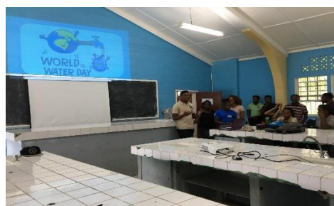
Oral presentation - Group 1