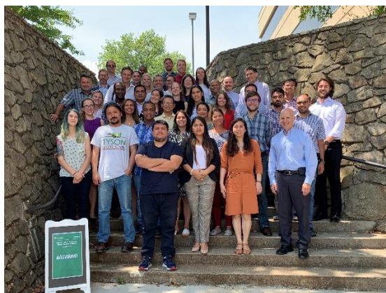
Group photos of all the participants and trainers