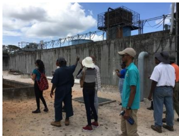
Students touring the Amelia's Ward Water Treatment Plant