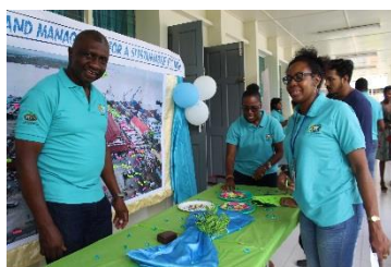
MSc. UPM Booth

The FEES displayed various models that depicted the Theme. The FEES once again took the opportunity to encourage students to apply for the current programmes; the BSc. in Environmental Studies, BSc. in Environmental Science and the BSc in Geography, MSc in Urban Planning and Regional Planning (revised MSc in Urban Planning & Management) and the MSc in Environmental Management. For the second year, the PhD in Biodiversity Programme was on display. Moreover, the staff discussed numerous career paths that the students can undertake after attaining a Degree from the Faculty. Graduates and Undergraduate students were selected to produce video recordings to explain the Faculty's Mission. Further, the FEES explained some of the course contents to the students which allowed them to appreciate the programmes offered by FEES. FEES also showcased the Water Testing equipment, the GIS equipment such as the Drones and the GPS, and how to transform the Stabroek area in Georgetown (refer to photos).