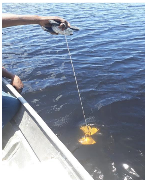
Participant using a Secchi disc