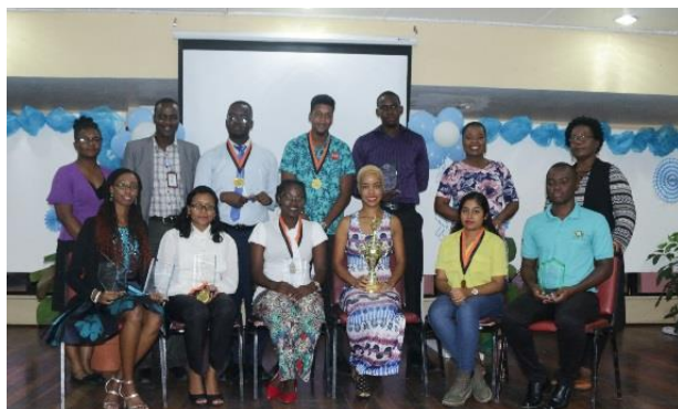
FEES Awardees and Medalist for 2017/2018