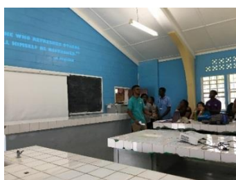
Oral presentation by representative of second group of students of ENV 3210