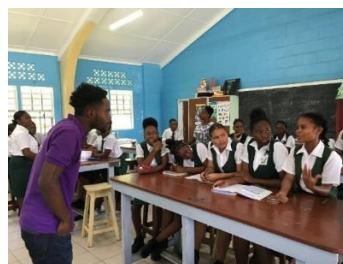
Students of McKenzie High School