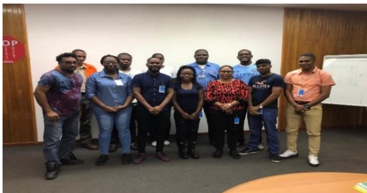
Students visitation to Alfobaka Hydropower Plant in Suriname

The Master of Science in Environmental Management for the academic year 2018/2019 Course ENV 5208 – Sustainable Energy and Development in partial fulfillment of the course conducted a field exercise to the Alfobaka Hydropower Plant in Suriname. The trip was conducted mainly to expose the students to a renewable energy technology and to build capacity in the area of sustainable energy development and its applications. Students attending this field exercise were able to collaborate and foster the exchange of ideas and technical know-how related to hydropower development. This tour plays a vital role in the promotion, transfer and dissemination of technology within the various organizations represented by the students.