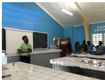
Oral presentation - Group 2