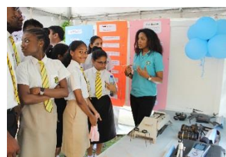
Staff interacting with the participants