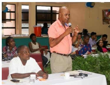
City Council representatives